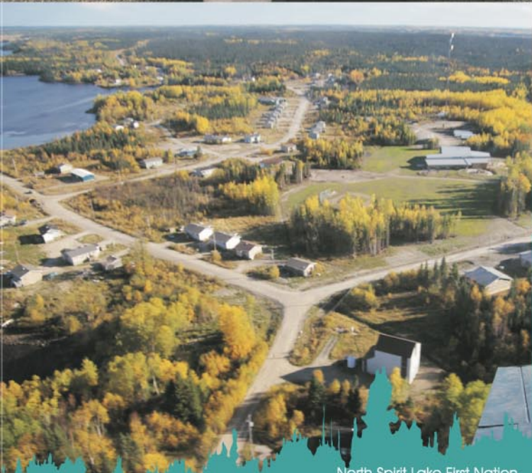
North Spirit Lake First Nation

"Over the years we have seen how telemedicine has improved access to health care services within our communities. These Services combined with community based health services are helping us to improve our overall health"