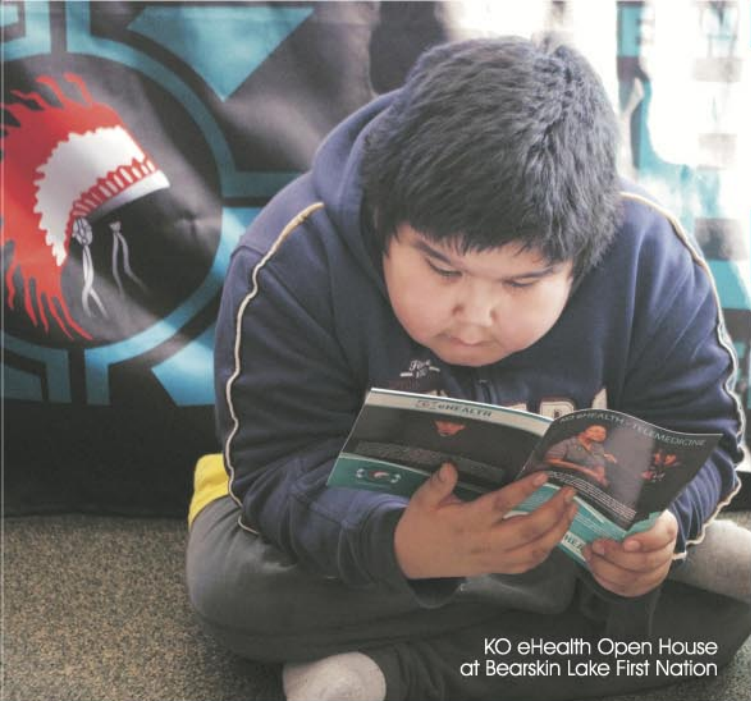
KO eHealth Open House at Bearskin Lake First Nation